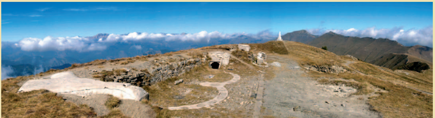
Piazzole per i cannoni sulla cima del Monte Saccarello